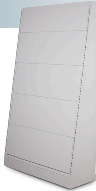
Single Faced Upright Unit 67½"H x 14"D x 39"W with left and right end panels