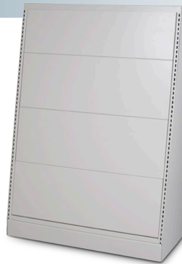
Double Faced Upright Unit 55½"H x 20"D x 39"W with pair of end panels