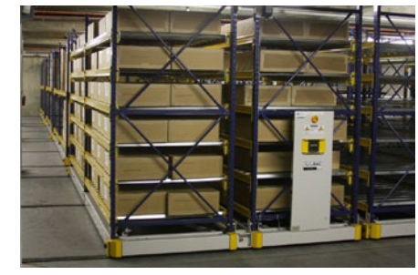
ActivRAC® Mobilized Storage System From blankets, boots, coats and cots, to parachutes, life vests, inflatable life boats and emergency medical kits, our ActivRAC Mobilized Storage Systems let you warehouse bulky items in half the space of conventional storage options, with secure access control.