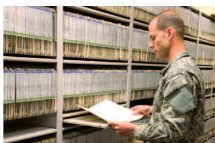
Records Management Solutions Consolidate medical records and sensitive documents in central, supervised areas close to the point of need. Controlled access allows you to increase accountability and better manage your files.