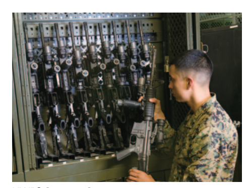
UWR® Storage System

As all military branches strive to forge a more transformable fighting force, Spacesaver stands ready to deliver storage solutions that combine maximum security with operational readiness – for any deployment scenario.