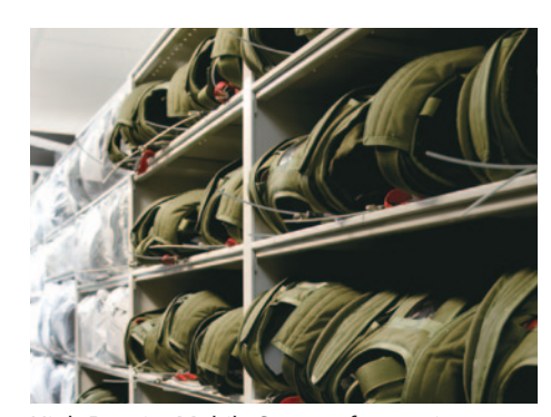
High-Density Mobile Storage for parajumpers