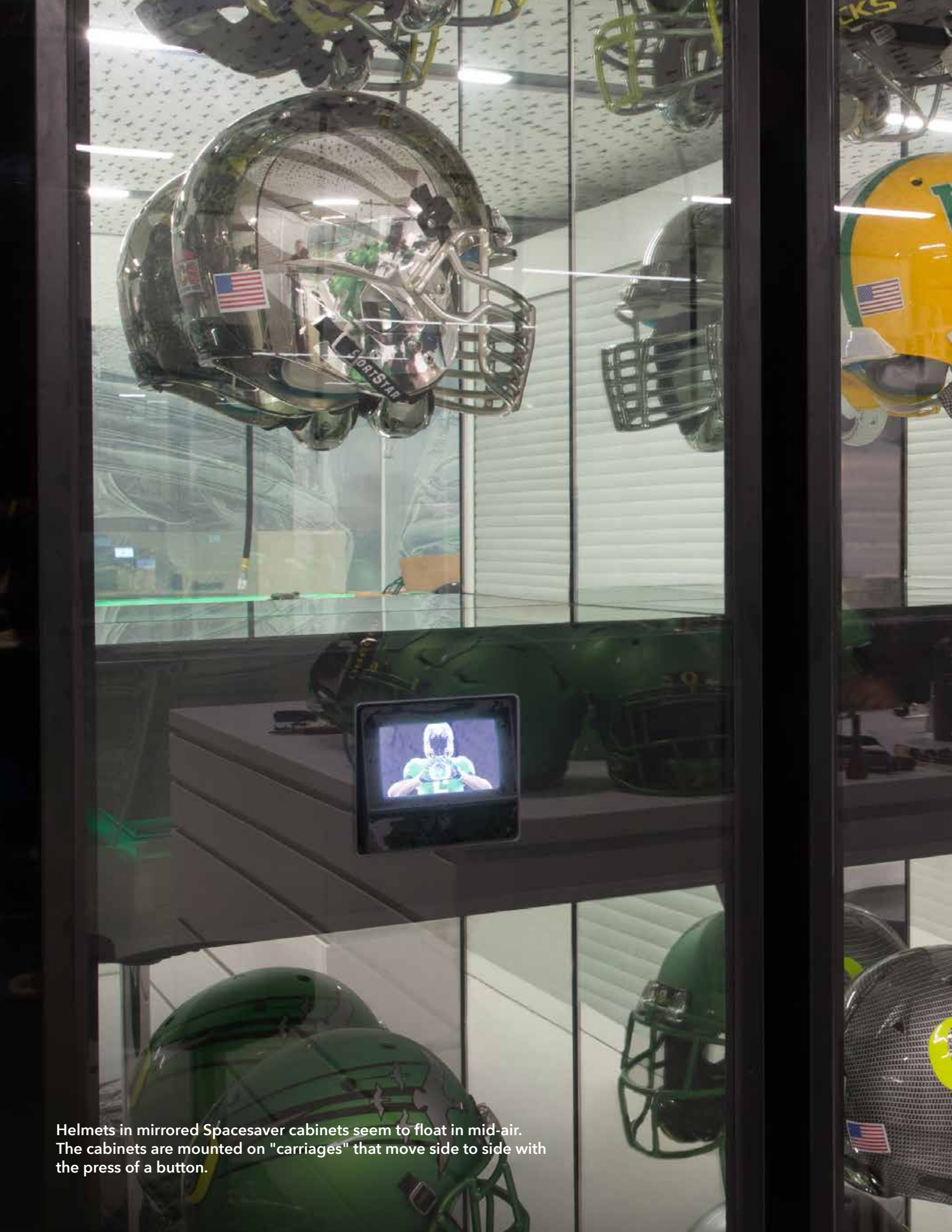
Helmets in mirrored Spacesaver cabinets seem to float in mid-air. The cabinets are mounted on "carriages" that move side to side with the press of a button.